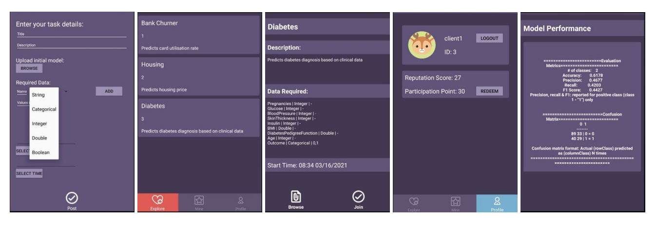
Figure 1: List a task Figure 2: View listings Figure 3: Requirements Figure 4: User profile Figure 5: Statistics