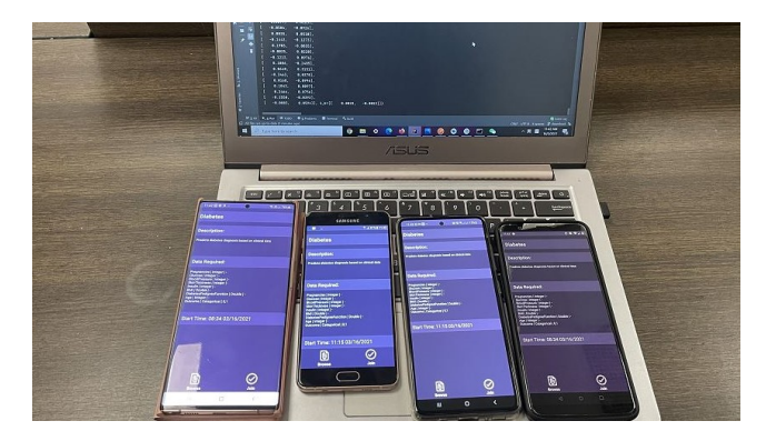
Figure 7: Experiment setup

For time sensitive tasks, mitigating straggling clients is important. When CrowdFL does not use device scores to select clients, all clients participate and the training is completed within 147 seconds, as the client with the lowest computation capability is included. With the use of the device score, the Device 1 (Table 2) was dropped and the training time decreased to 127 seconds.