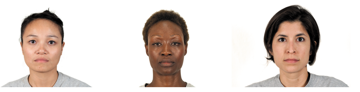
Figure 1: Example Chicago Face Database (CFD) images of Asian (AF-204), Black (BF-231) & White (WF-200) women.