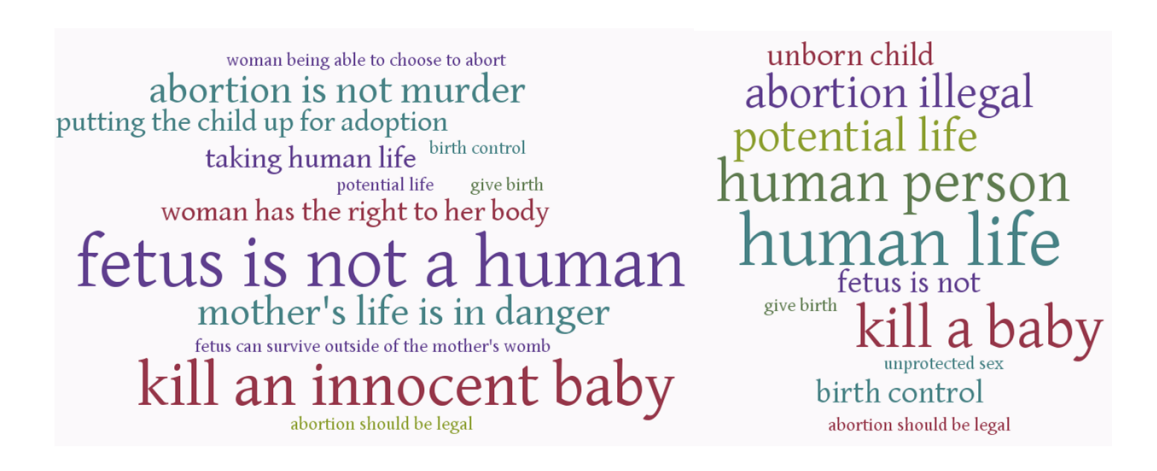
Figure 3: Word Clouds of argument facet labels generated by "PhAITV + Grouping + Extraction" (left) and "PhAITV + Extraction" (right)

corresponding unigram models, AITV and JTV, in terms of top-words coherence, for both datasets. This confirms the assumption that using the phrase mining module yields more coherent Topic-Viewpoint dimensions than considering only unigrams. However, this does not necessarily mean that phrase models lead to a better extraction of sentential reasons. We examine the effect of phrase mining on the extraction of relevant and informative sentential reason in the following sections. In general, PhAITV reaches higher median NPMI values than PhJTV. We will later compare the final output of the pipeline framework in terms of reasons clustering when using each one of these models as a Topic-Viewpoint component. Note that separately evaluating the performance of our Topic Viewpoint model in terms of document clustering has shown satisfiable results which we do not report here for lack of space. We are more interested in its impact on the final sentence-level viewpoint clustering.