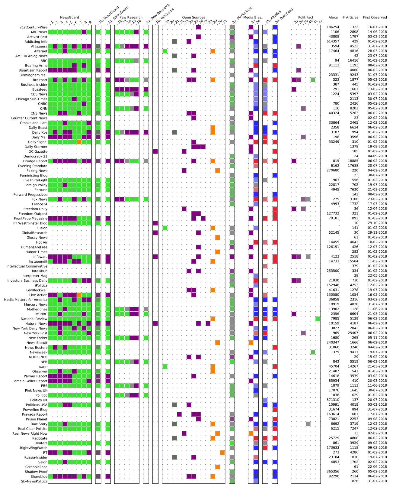
Table 3: Labelling of first part of sources.