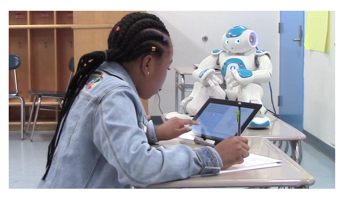
Figure 1: We studied the effects of the AT-POMDP policy on student learning in multiple tutoring sessions with a robot.

Although most prior work has focused on modifying and optimizing a single component of the robot-student tutoring interaction (e.g. building a model of student knowledge,