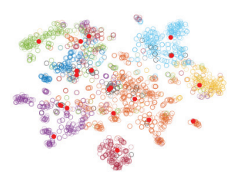
Figure 3: t-SNE visualization of learned network structural embeddings of Cora. Unfilled circles are individual nodes and inducing points are denoted as red dots.

points with a smaller learning rate, which is set to one-tenth of the learning rate for the text encoder. The inducing points z are visualized as red filled circles in Figure 3. Textual embeddings are plotted with 7 different colors, representing the 7 node classes. Note that the inducing points z fully cover the space of the categories, implying that the learned inducing points meaningfully cover the distribution of the textual embeddings.