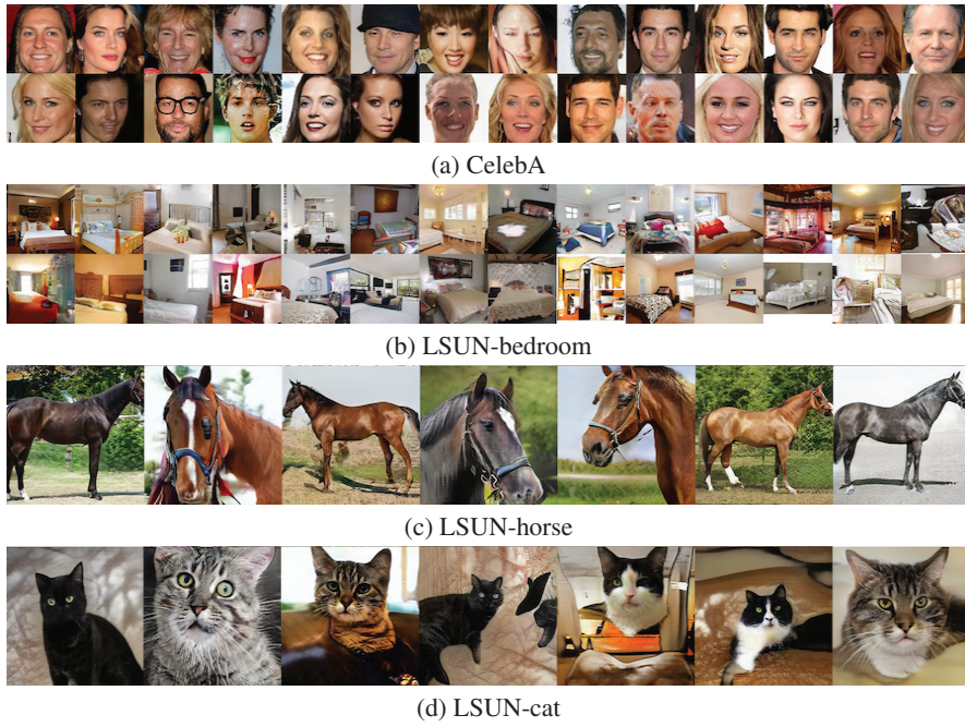
Figure 3: Generated samples for various datasets. (a) CelebA ( 128 \times 128 ), (b) Bedroom ( 128 \times 128 ), (c) Horse ( 256 \times 256 ), (d) Cat ( 256 \times 256 ).

capsule convolution layer with kernel size of (8, 16, 3, 3) . The third layer has the same structure of upsampling and subspace capsule convolution layer as the second layer except that it has the kernel size of (8, 8, 3, 3) . This is followed by the last subspace capsule convolution layer with kernel size of (8, 8, 3, 3) . The final layer is a transposed convolution layer with the receptive field of (5 \times 5) with stride of 2 followed by sigmoid activation function. All subspace capsule convolution layers have stride 1 and squashing activation function. The discriminator architecture is composed of 4 convolution layers with receptive field of (5 \times 5) and stride of 2. We apply batch normalization to all convolutional layers and the activation function is leaky Relu with slope of 0.2. This is followed by a global mean pooling and a fully connected layer to 10 output classes.