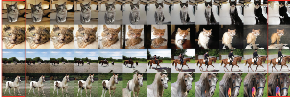
Figure 4: In each row, the first and last samples in the red boxes are generated using two independent noise vectors. The intermediate samples are generated by walking through the linear interpolant of those two noise vectors.

subspace capsule convolution layer with n capsule types, c -dimensional capsule subspaces and a receptive field of k \times k .