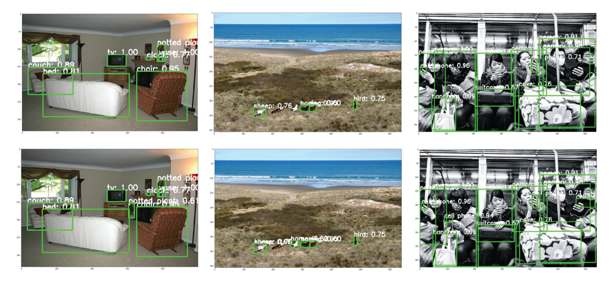
Figure 3: Detection examples for COCO dataset. The first row shows detection results from the pretrained detector. The bottom row shows the results from our proposed method. The confidence threshold is 0.6 for display.

spectively. We exclude the comparison with results acquired on higher resolution images, such as a shorter edge of 1000 pixels. Note that using higher resolution images is known to deliver better performances regardless of the underlying method, due to the higher resolution for small objects.