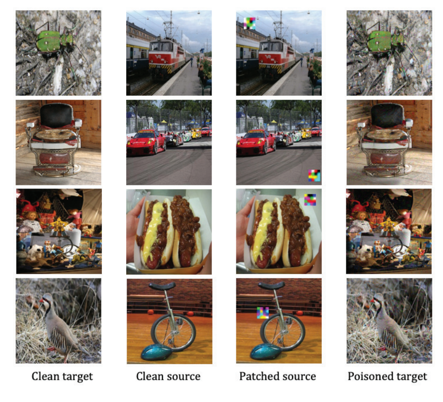
Figure 3: Visualization of target, source, patched source, and poisoned target images from different ImageNet pairs. For each row, the image in the fourth column is visually similar to the image in the first column, but is close to the image in the third column in the feature space. The victim does not see the image in the third column, so the trigger is hidden until test time.

adversarial examples. It takes about 5 minutes to generate 100 poisoned images on a single NVIDIA Titan X GPU.