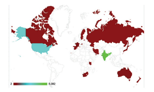
Figure 1: Choropleth world map recording tweet frequency.

Table 2: Distribution of tweets by the country.