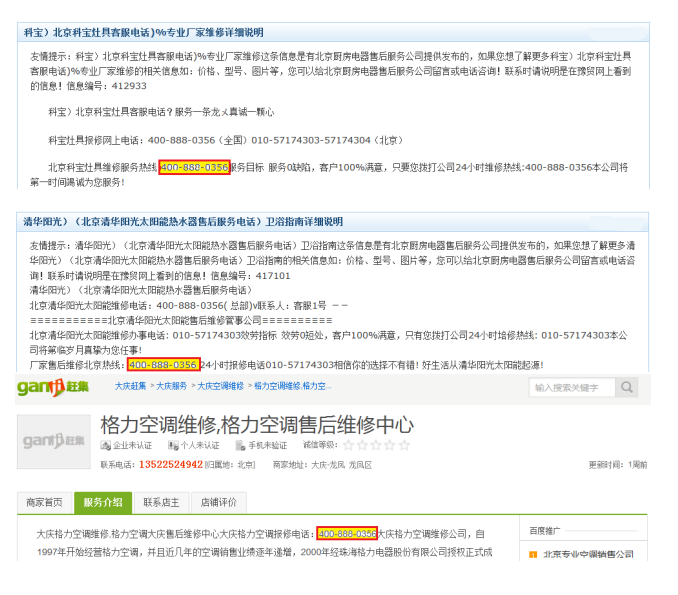
Figure 1: Examples of several fraudulent support telephone numbers and their corresponding Web pages. The first two examples are extracted from two spam pages within the same domain, which describe a stove brand and a water heater brand, respectively. The highlighted sections are the declared official phone numbers for each brand, which are the same. The last example is extracted from an ordinary Web 2.0 page located on Ganji.com, which contains the same fraudulent support phone number.

fraudulent support phone information. Therefore, nearly all Chinese search engines encourage reputable support service providers to register their telephone information with the search engine so that this "official" information could be placed at the top of a ranking list. However, the number of products and service providers is so large that it is difficult to compel all of the providers to approach the search engines to register. Additionally, the various forms of user query make it difficult to identify all of the queries with similar intents and connect them with the official information. Thus, it is important to identify fraudulent support telephone numbers and warn search engine users regarding the false information provided on Web pages. Based on the assumption that neither official service providers nor swindlers will place fraudulent support phone numbers together with official numbers on the same page or page block, we propose a framework to detect fraudulent support phones based on their distance from seed official telephone numbers and seed misleading telephone numbers on a page-level/page-blocklevel co-occurrence graph.