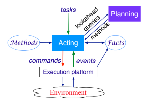
Figure 1: Acting with continual online planning.

Paolo Traverso FBK ICT IRST Trento, Italy